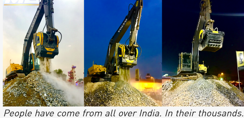
And they witnessed a real demonstration of the MB Crusher and Screening Buckets at work. Last December, MB India Pvt LTD, Indian branch of MB

Crusher, participated in the ninth edition of the Excon fair. Organised in Bangalore. Excon is one of the most important events in the field of construction equipment and technologies: 925 exhibitors on an area of 250,000 square metres. An important showcase for a fast growing market like the Indian one. MB Crusher has set up a real construction site at the fair.